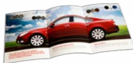
High productivity for large-sized marketing collateral.

PrintOS. Print Beat provides visibility to press performance to drive continuous improvement to print operations. PrintOS Site Flow efficiently manages any number of jobs per day, even hundreds or thousands. Automate, simplify and streamline files submission with PrintOS Box. Use PrintOS Composer for heavy VDP processing including sophisticated HP SmartStream Mosaic campaigns.